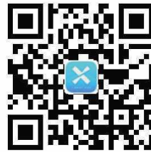
App - Android