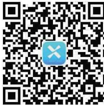
App - Google