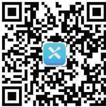
App - iOS